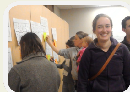
Sharing ideas in January 2017

Please come with ideas and input on where our community has been, what is working, and where we are going next. Dinner will be provided. All are welcome!